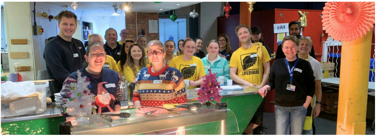
Some of our incredible volunteers